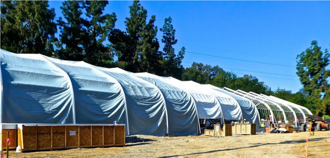
A temporary homeless shelter on Riverside Drive near Griffith Park is on track to open in June.

Click here for more information on home-sharing in L.A