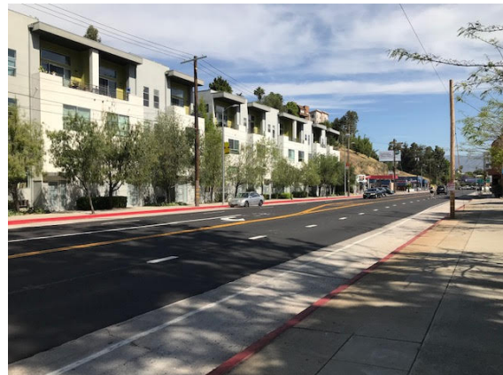
Photo on left shows partially reopened Fletcher Avenue. LADWP expects the busy traffic corridor to be fully opened by May 16. Photo on right shows a portion of newly paved Glendale Boulevard.