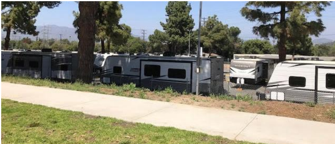
Trailers parked in Friendship Auditorium parking lot on Riverside Drive.