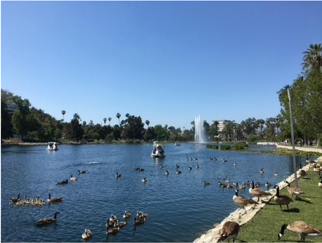
Area birds turned out in full force for the reopening of Echo Park Lake