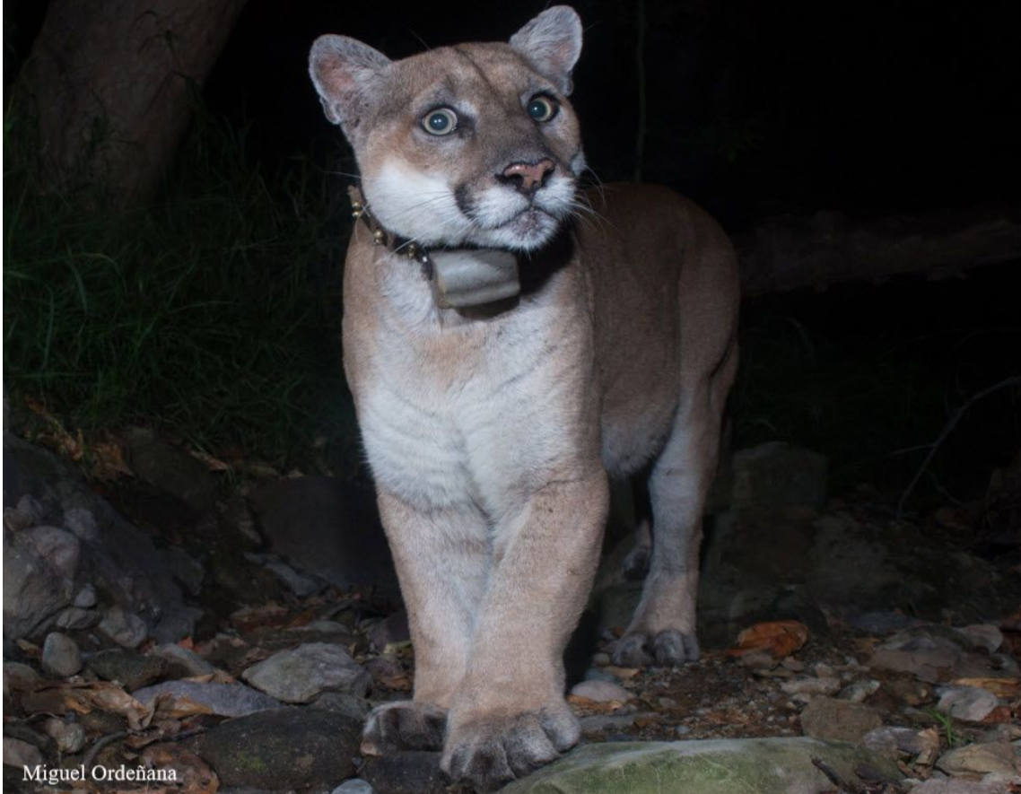
P-22, L.A.'s famous mountain lion seen in Griffith Park.