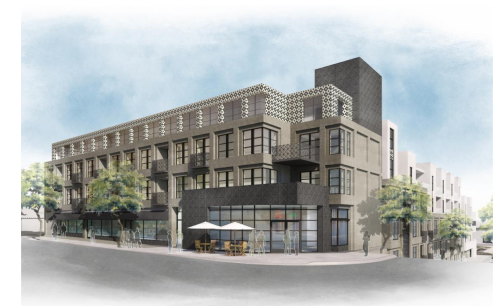
4100 Sunset Boulevard and 4311 Sunset Boulevard