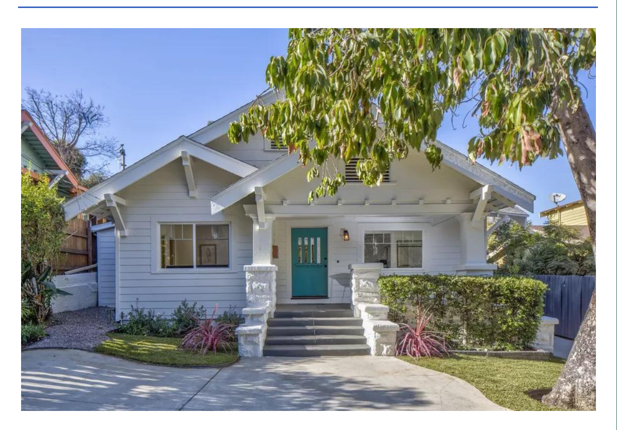
A Silver Lake Tradition: Craftsman Style Homes

If you are experiencing a flooding problem in your neighborhood, <u>email</u> <u>editor@silverlaketogether.com</u>