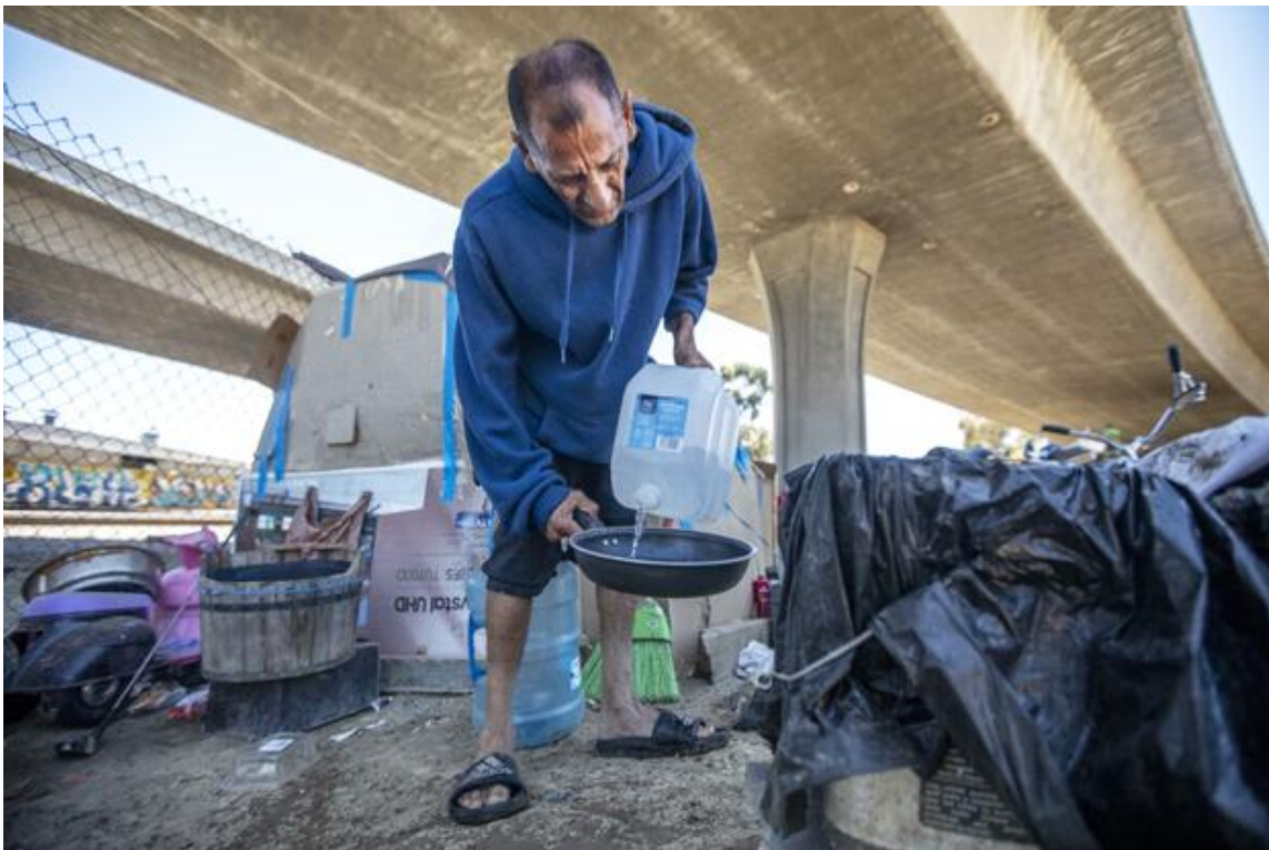
A man washes a skillet outside his camp under a ramp linking the 110 to the 105 Freeway in Los Angeles.