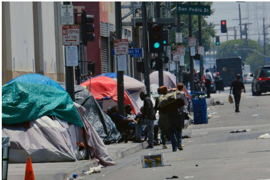
The number of homeless people in Los Angeles jumped over the past year.