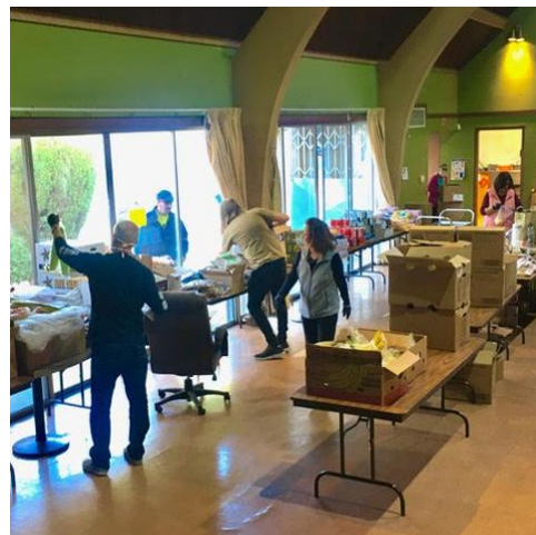
The SLCC Food pantry has adapted