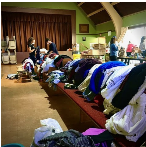
Volunteers from the surrounding

Back in 2017, the L.A. Bureau of Street Services scheduled much needed street repairs on West Silver Lake Drive, between Redesdale Avenue and Westerly Terrace. But, many residents were concerned because the city planned to use asphalt to repair the street and not the traditional concrete. That decision ignited grassroots efforts, with assistance from members of the 2017 Silver Lake Neighborhood Council board, to ensure that concrete would be used for the repairs. Although the city denied the demands for concrete due to the higher costs, those who were fighting for concrete did not back down. The community persisted, the city listened and last weekend, the Bureau of Street Services, under the supervision of Eric Belmares, made repairs with concrete. Thank you CD13 and Street Services for taking the needs of the Silver Lake residents seriously.