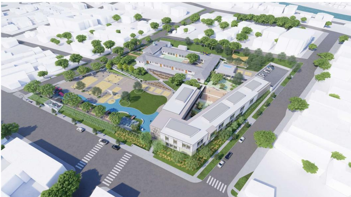
Rendering of the project to add classrooms and food service facility at Ivanhoe

According to the Daily News , The Friends of Griffith Park and the Griffith J. Griffith Charitable Trust have filed a petition in Los Angeles Superior Court stating that the city "... should not have certified the Environmental Impact Report associated with the project before specific plans for mitigating significant environmental impacts have been drawn up..." L.A. City Council also recently fast-tracked approval of the Environmental Impact Report conducted for the Silver Lake Reservoirs' Master Plan, and numerous community members cited environmental concerns about destruction of natural wildlife habitats and noise and air pollution associated with the project. Stay tuned for more on this topic.