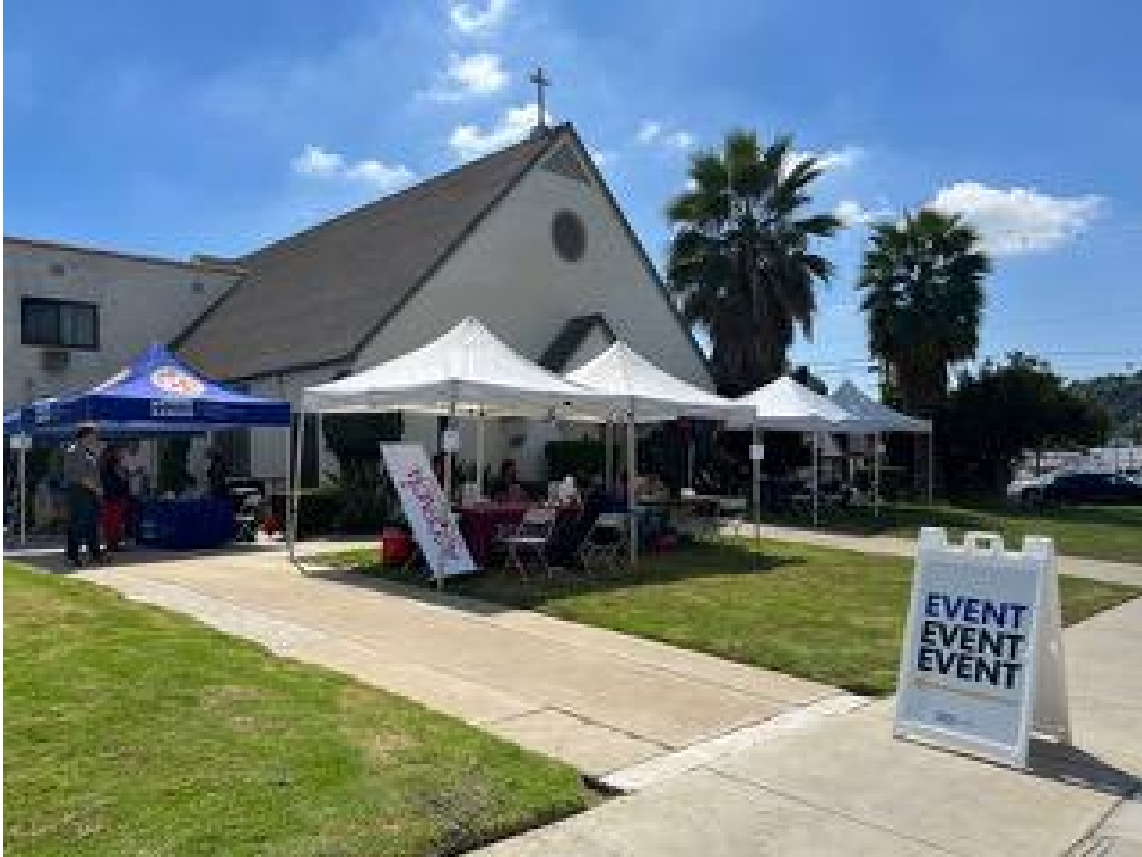
Silver Lake Community Church hosted the Neighborhood Support Day event as part of its ongoing service to people experiencing homelessness.