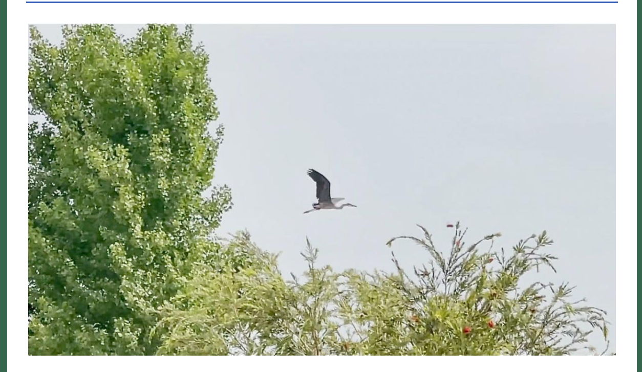
Rescued heron takes off following release.